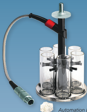
Automation basket (also available with 3 tubes for big capsules and tablets)